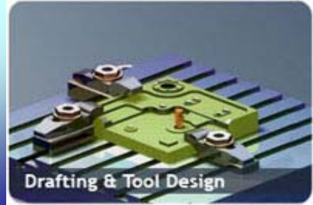
Drafting & Tool Design